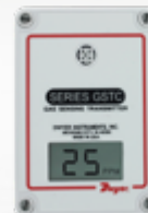
Sensor with LCD *also available without LCD

Image now shows acceptable CO level with Pacific Ventilation jet fan design implemented.