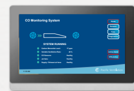
HMI touch control screen