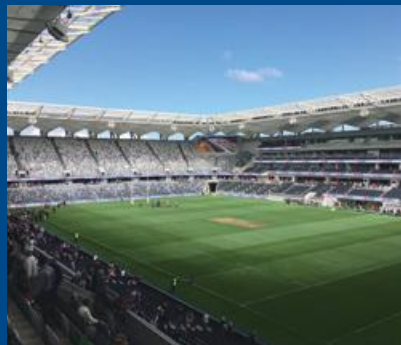
Parramatta Stadium, NSW