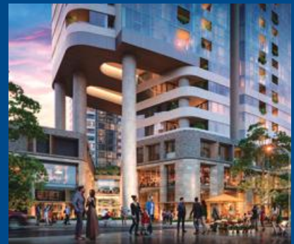
Rhodes Shopping Centre, NSW