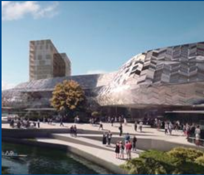
Christchurch Entertainment, NZ