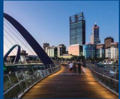
Elizabeth Quay, WA