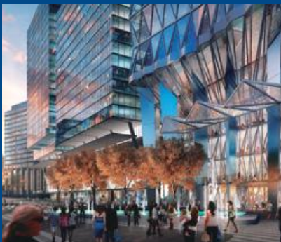
Parramatta Square, NSW