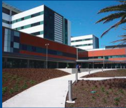
Wellington Hospital, NZ